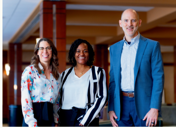
Participants at the 2026 IMHSN Convening